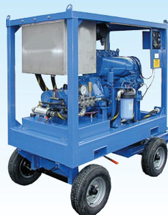
HPS400 DST (Diesel Site Trailer)