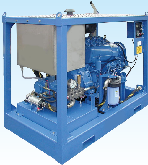
HPS400 Diesel Crashframe